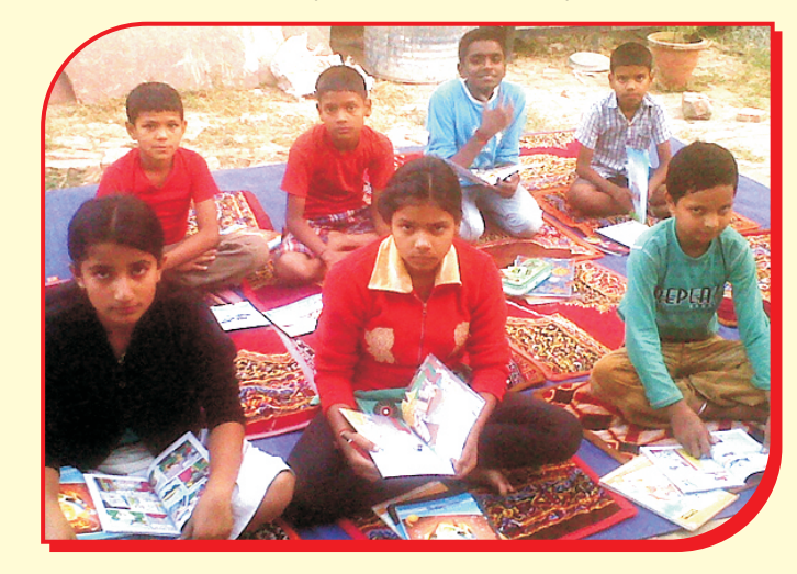
Children reading books in open library at Basic Education Centre, Samaspur (Gurgaon)