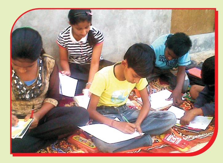
Children participating in Drawing Competition